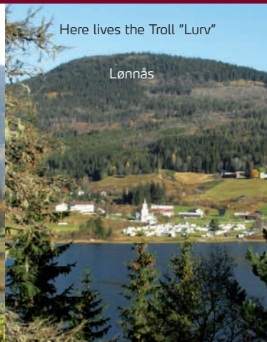
Here lives the Troll "Lurv"