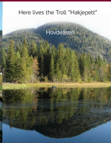
Here lives the Troll "Hakjepett"