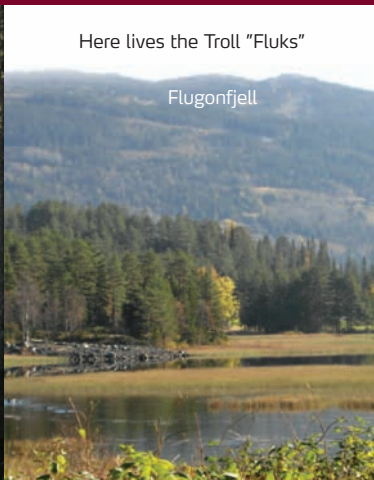
Here lives the Troll "Fluks"